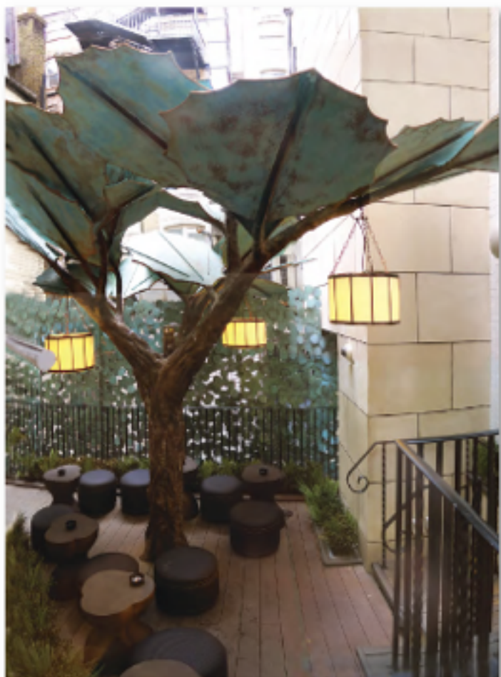
The extraordinary cigar terrace, covered by a custom-made tree sculpture, at L'Oscar